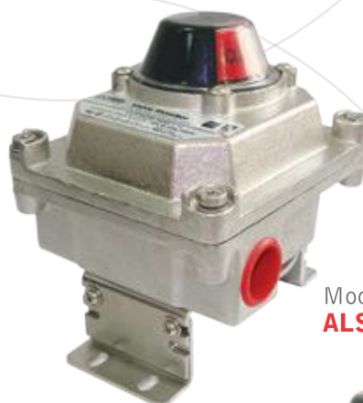
Model No: ALS600M4