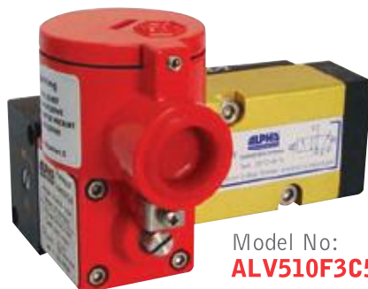
Model No: ALV510F3C5