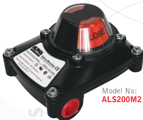
Model No: ALS200M2