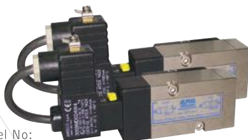
Model No: ALV610F3C7