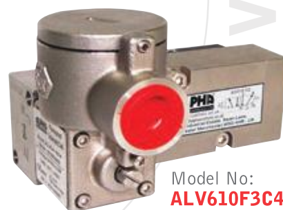
Model No: ALV610F3C4