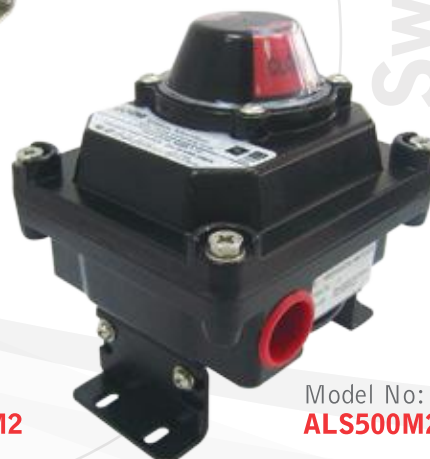
Model No: ALS500M2