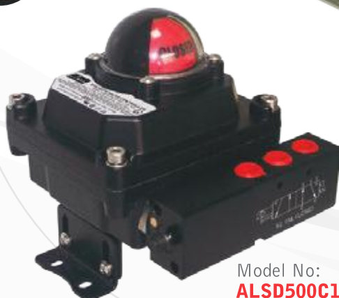
Model No: ALSD500C1S1M2