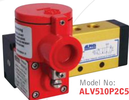
Model No: ALV510P2C5

ALPHA CONTROLS | SOLENOID VALVES & SWITCHBOXES